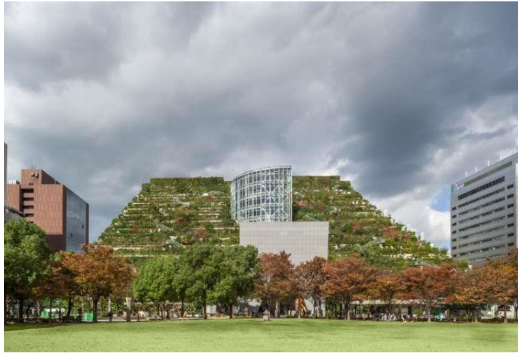
ACROS, Fukuoka Prefectural International Hall, Fukuoka, Japan, 1990

This new website is a collection of works, realized, designed, or imagined, in architecture and urban design, industrial design and graphics, along with a biography, as well as some of the many press clippings on his work. The new website also includes a section dedicated to outstanding testimonials (from Tadao Ando to Ettore Sottsass, through Mario Bellini, Alessandro Mendini, and Ryuichi Sakamoto) about the personality, thoughts, works, and visions of Emilio Ambasz.